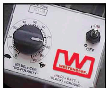
Electronic Flow Control

Westendorf Manufacturing adds a dump system to its already diverse line of products. The Dump Spreader is the first all-hydraulic spreader on the market today. Its simple design concept and versatility make it the obvious