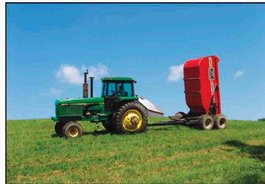
Unique patented dump motion keeps center of gravity low for steady operation over all types of terrain.

patented dump motion that centers the load over the wheel base. Unlike a dump truck, where the center of gravity moves out past the rear wheels, the spreader has a unique dump motion that utilizes hydraulic arms and cylinders with a high pivot mount to maintain a low center of gravity. As a result, the spreader remains balanced and steady at all heights and over rough terrain.